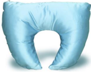
Crescent Pillow Mate - Blue SKU 3955853 UPC 004129879334 Vendor # 555-7933-1000 (DMI)