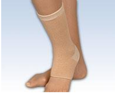
Therall Arthritis Warming Ankle Support