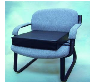
Deluxe Seat Lift Cushion 4" Firm SKU 3978798 UPC 4129808884 Vendor # 513-8884-0200 (DMI) 16" x 16" x 4"