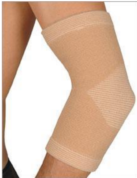
Therall Arthritis Warming Elbow Support