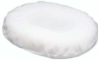
Foam Invalid Cushion SKU 2447100 UPC 002360187010 Vendor # P701-00 (Carex)