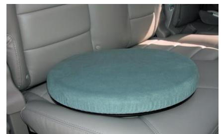
Swivel Seat SKU 4770020 UPC 008019629696 Vendor # MDSSWIVELW