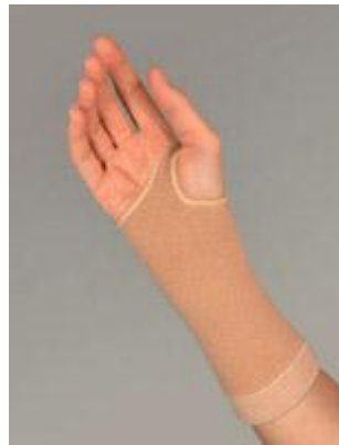
Therall Arthritis Warming Wrist Support