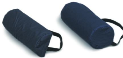
Lumbar Back Support Half Roll SKU 3955929 UPC 004129807914 Vendor # 555-7914-2400 (DMI)