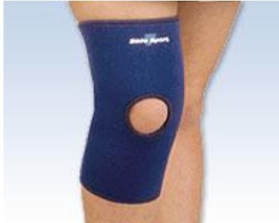
Neoprene Knee Sleeve – Navy Pediatric Size Large SKU # 4274783 Vendor # 37-373275 by FLA