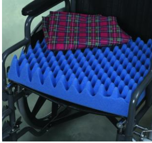
Convoluted Wheelchair Pad SKU 3955754 UPC 004129807638 Vendor # 552-8004-9910 (DMI)