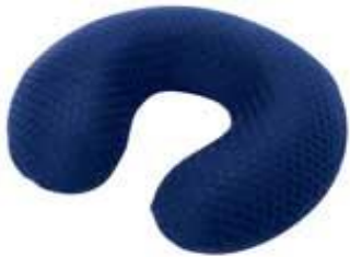
Travel Pillow SKU 4525044 UPC 002360103108 Vendor #P108-00 (Carex)