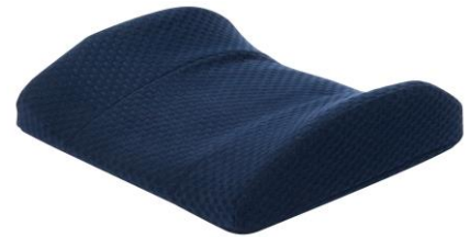
Cushion Lumbar Support SKU 4525069 UPC 002360103106 Vendor # P106-00 (Carex)