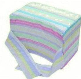
Pillow Knee Ease - Stripe SKU 3955630 UPC 004129879811 Vendor # 555-7981-0000