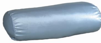
Pillow Cervical Contour SKU 5432174 UPC 004129880245 Vendor # 554-8024-1000 (DMI)