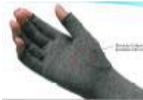
Arthritis Gloves by IMAK Breathable for all day use