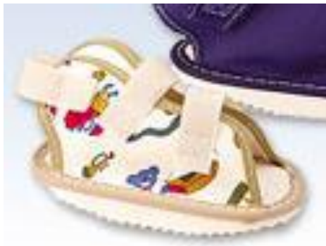
Canvas Rocker Bottom Cast Shoe Print SKU 4274809 Vendor # 43-101204 by FLA