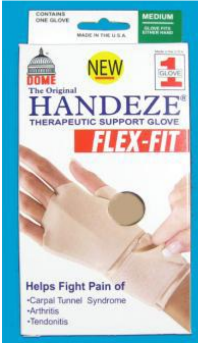
Handeze Flex-Fit Glove by Dome