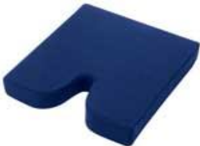
Coccyx Memory Foam Cushion SKU 4525101 UPC 002360103101 Vendor #P101-00 (Carex)