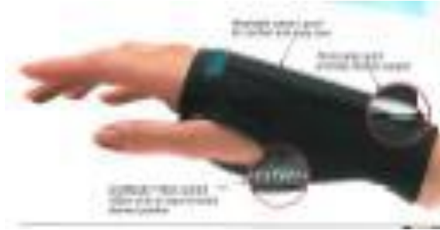
Smart Glove – Reversible by IMAK With massaging ergobeads