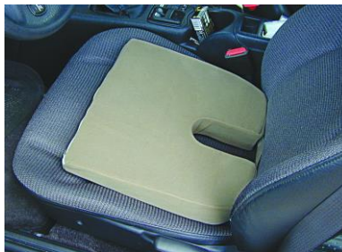
Sloping Coccyx Cushion - Camel SKU 5459094 UPC 004129807939 Vendor # 513-7939-3700