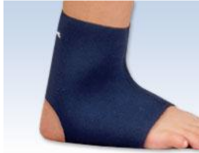
Neoprene Ankle Support Pediatric Size Youth – Ages 8-12 SKU # 4274791 Vendor # 40-701307 by FLA