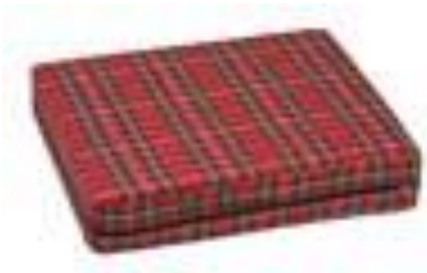
Wheelchair Cushion SKU 3955721 UPC 004129807606 Vendor # 513-7606-9910 (DMI) 16" x 18" x 4"