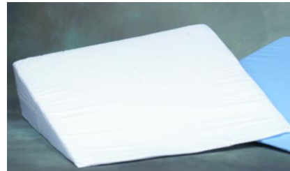
White Foam Bed Wedges SKU 5274410 UPC 004129880204 Vendor # 802-80271900 (DMI) 10" bed wedge