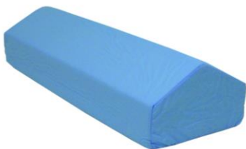
Elevating Leg Rest SKU 3955960 UPC 004129808080 Vendor # 555-8080-0121 (DMI)