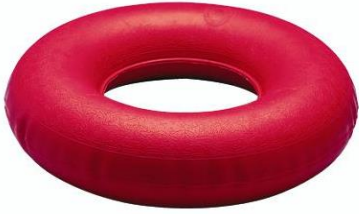
Inflatable Rubber Invalid Cushion SKU 2447076 UPC 002360187030 Vendor # P703-00(Carex)